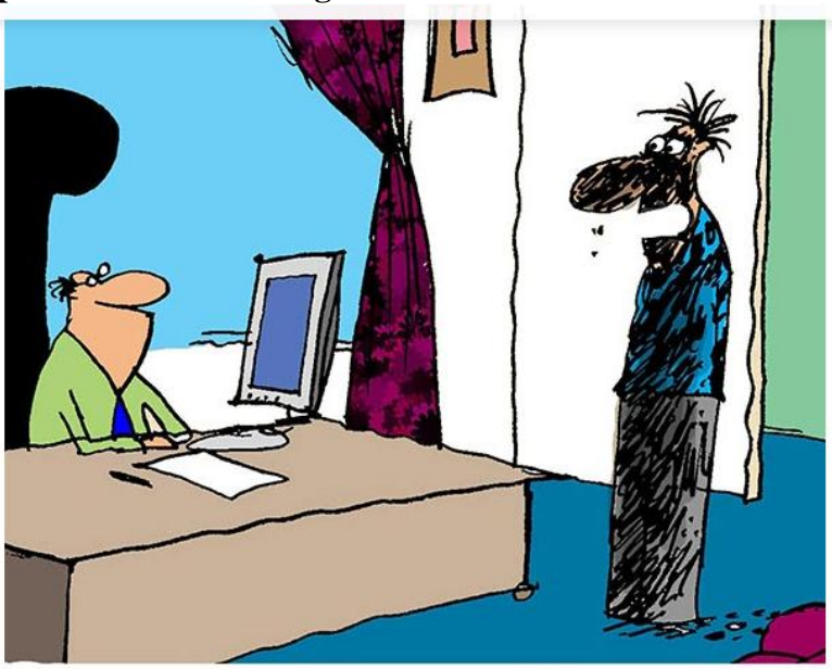
"Sorry I'm late. I wanted to wash my Corvette since it's not raining. Luckily, I didn't get my tie dirty."

\frac{http://www.corvetteblogger.com/2018/03/17/saturday-morning-corvette-comic-bad-weather-keeps-\\ \underline{washing\text{-}corvette/}